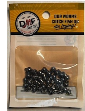
PINCH ON SINKERS SMALL