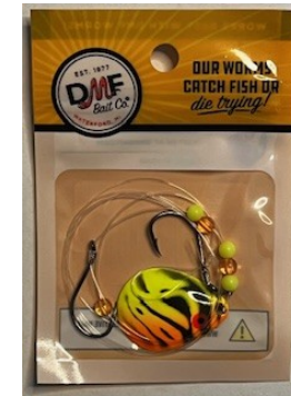
LIVE BAIT SPIN RIG