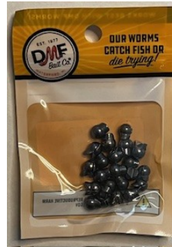
PINCH ON SINKERS LARGE