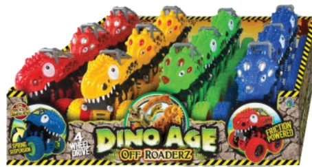
DINO AGE OFF ROADERZ