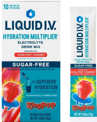
RINGPOP LIQUID IV