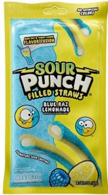
SOUR PUNCH FILLED BLUE RASPBERRY LEMONADE