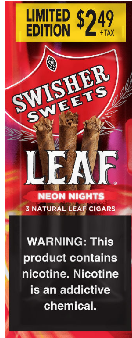
SWISHER NEON NIGHTS