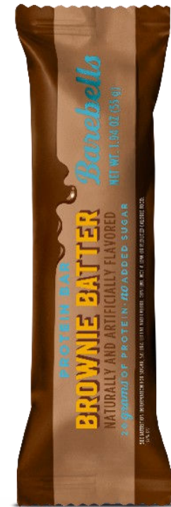
BAREBELL BROWNIE BATTER