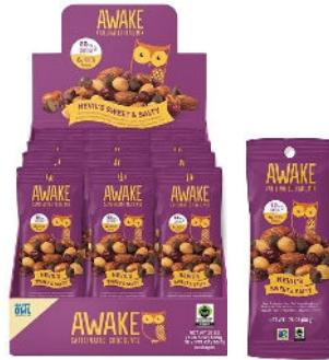
SWEET AND SALTY